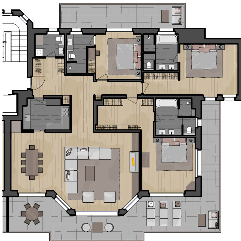
Three bedroom Suite Apartment

Breakfast daily Housekeeping Service twice daily Porter Service Valet Service Access to the private lounge Ski & Golf Room Shoe Polishing Private transfers around Crans-Montana Alcohol-free minibar Wifi Taxes & Service